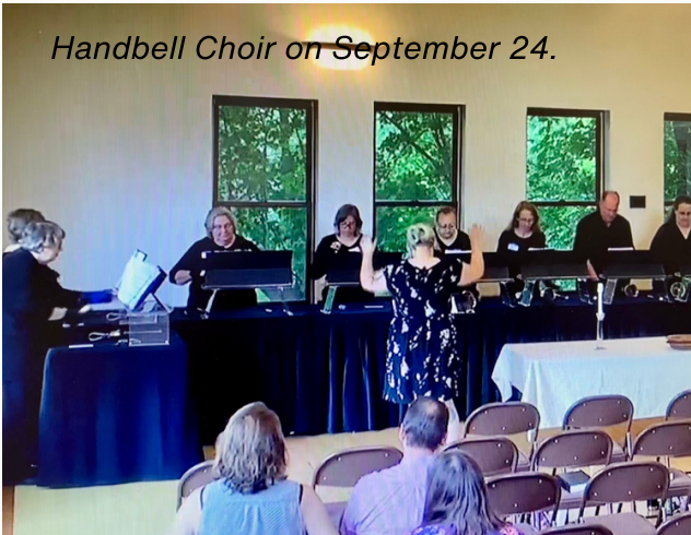
Handbell Choir on September 24.