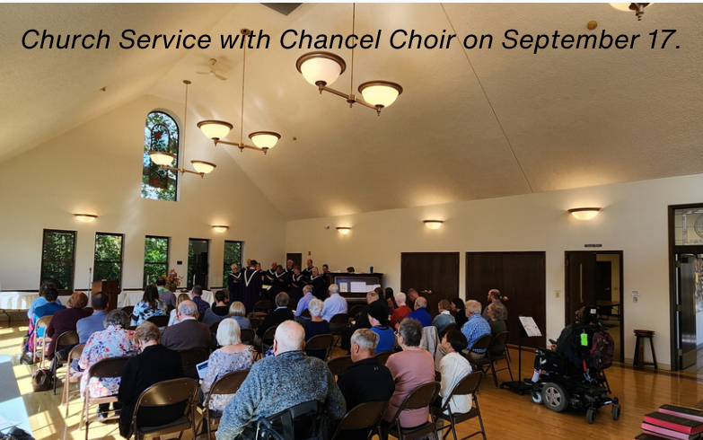
Church Service with Chancel Choir on September 17.