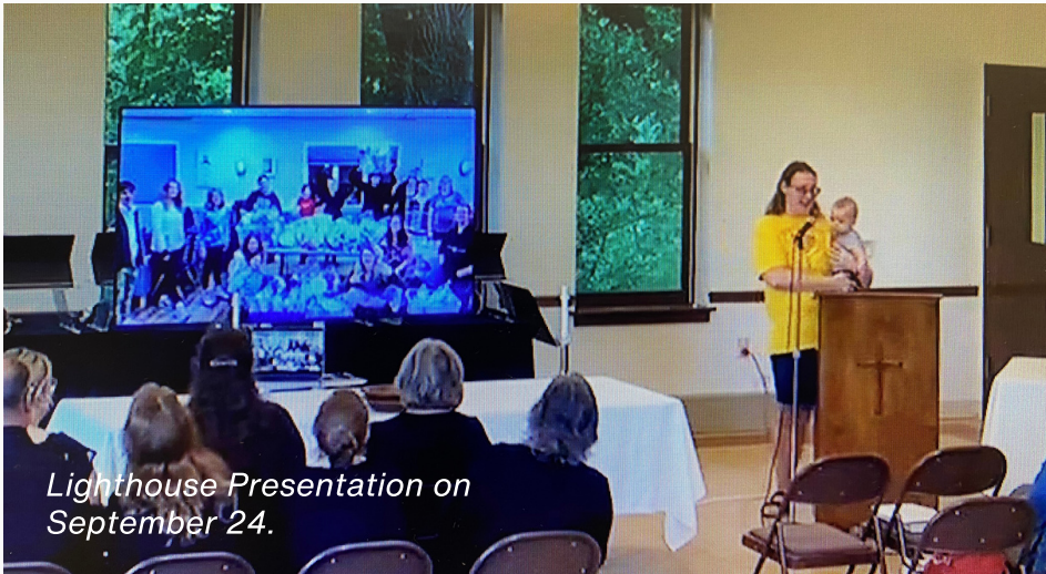
Lighthouse Presentation on September 24.