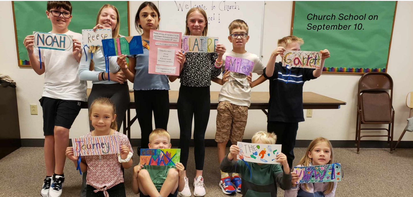
Church School on September 10.