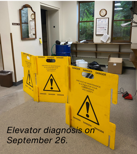
Elevator diagnosis on September 26.